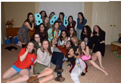
Big/little sleepover 2016